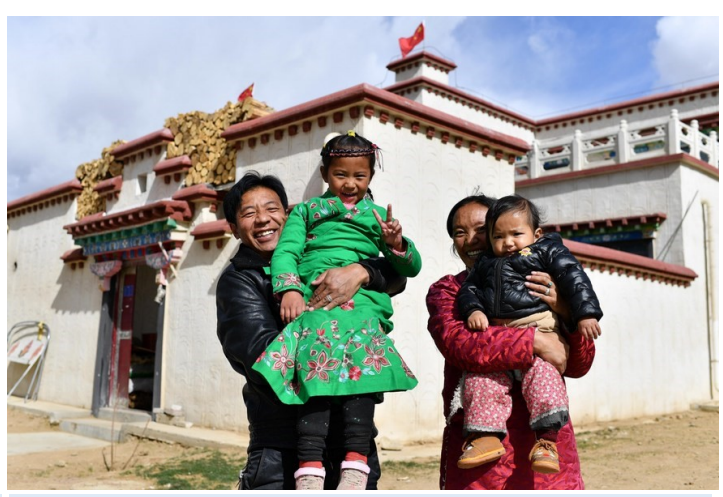
Local residents pose for a photo in front of their new house in Gurum Township of Lhasa, southwest China's Tibet Autonomous Region