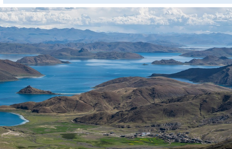
The scenery of the Yamdrok Lake in Nagarze County of Shannan City, southwest China's Tibet Autonomous Region