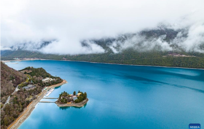
A view of the Basum Lake in Gongbo'gyamda County of Nyingchi, southwest China's Tibet Autonomous Region