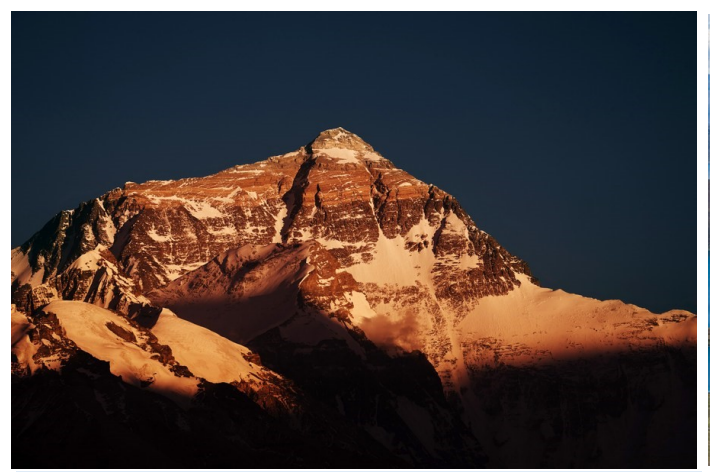
A view of Mount Qomolangma at sunset