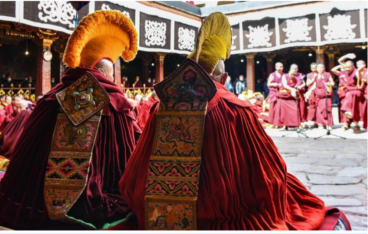
Monks attend a debate activity in the Jokhang Temple in Lhasa, capital of southwest China's Tibet Autonomous Region