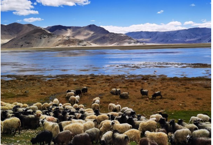
Grassland by the lake in Dinggye County, southwest China's Tibet Autonomous Region.