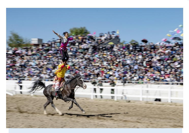
Riders perform on horseback to celebrate Lhasa Shoton (yogurt banquet) Festival in Lhasa, southwest China's Tibet Autonomous Region.