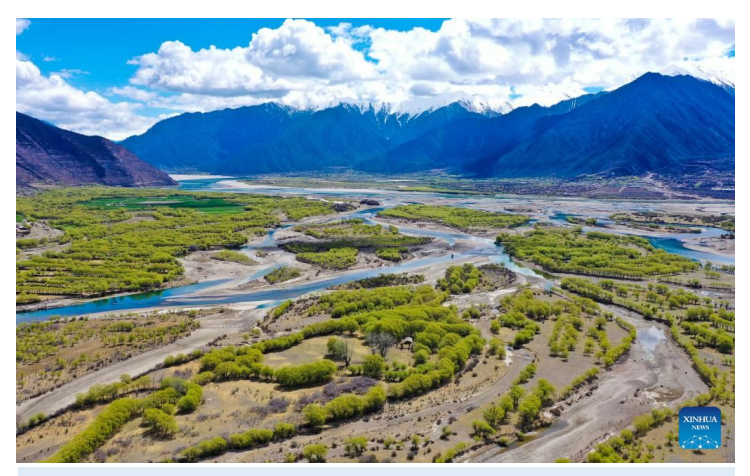
The spring scenery at Yani national wetland park in Nyingchi, southwest China's Tibet Autonomous Region