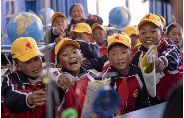
Pupils attend a science class at a primary school in Zhaxizom Township in Tingri County, Xigaze City, southwest China's Tibet Autonomous Region, June 5, 2023. The primary school of Zhaxizom Township is the closest school to Mount Qomolangma, with a distance of just over 40 kilometers.