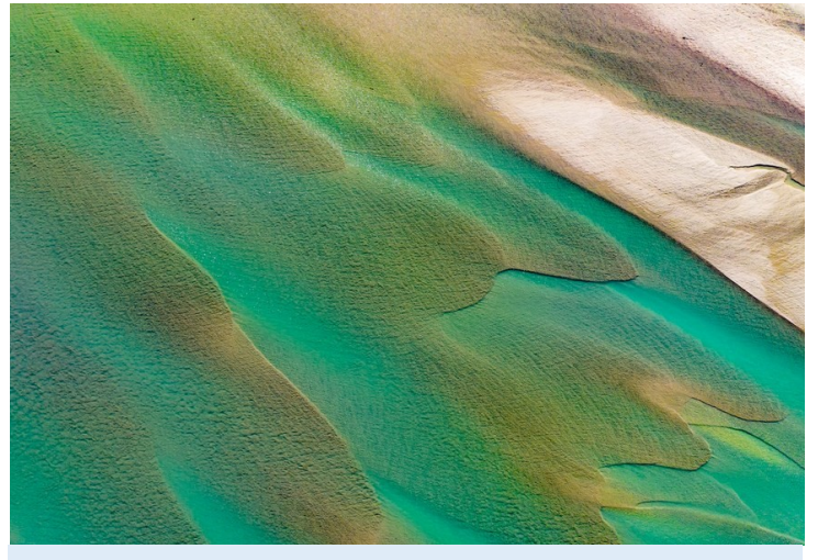
The scenery of Mainling section of the Yarlung Zangbo River in Mainling County of Nyingchi, southwest China's Tibet Autonomous Region.